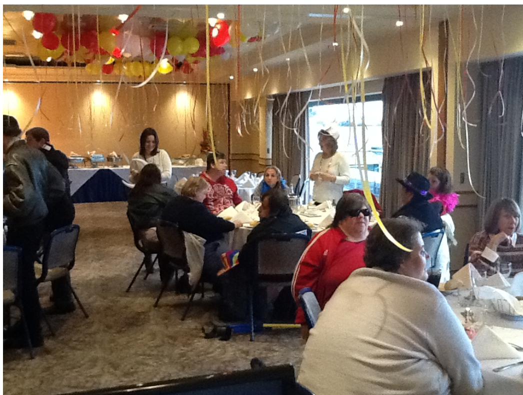
RAPS Big Birthday Party