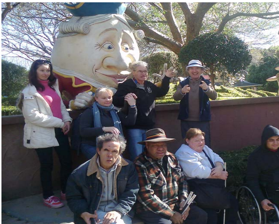
RAPS in the Hunter Valley Gardens