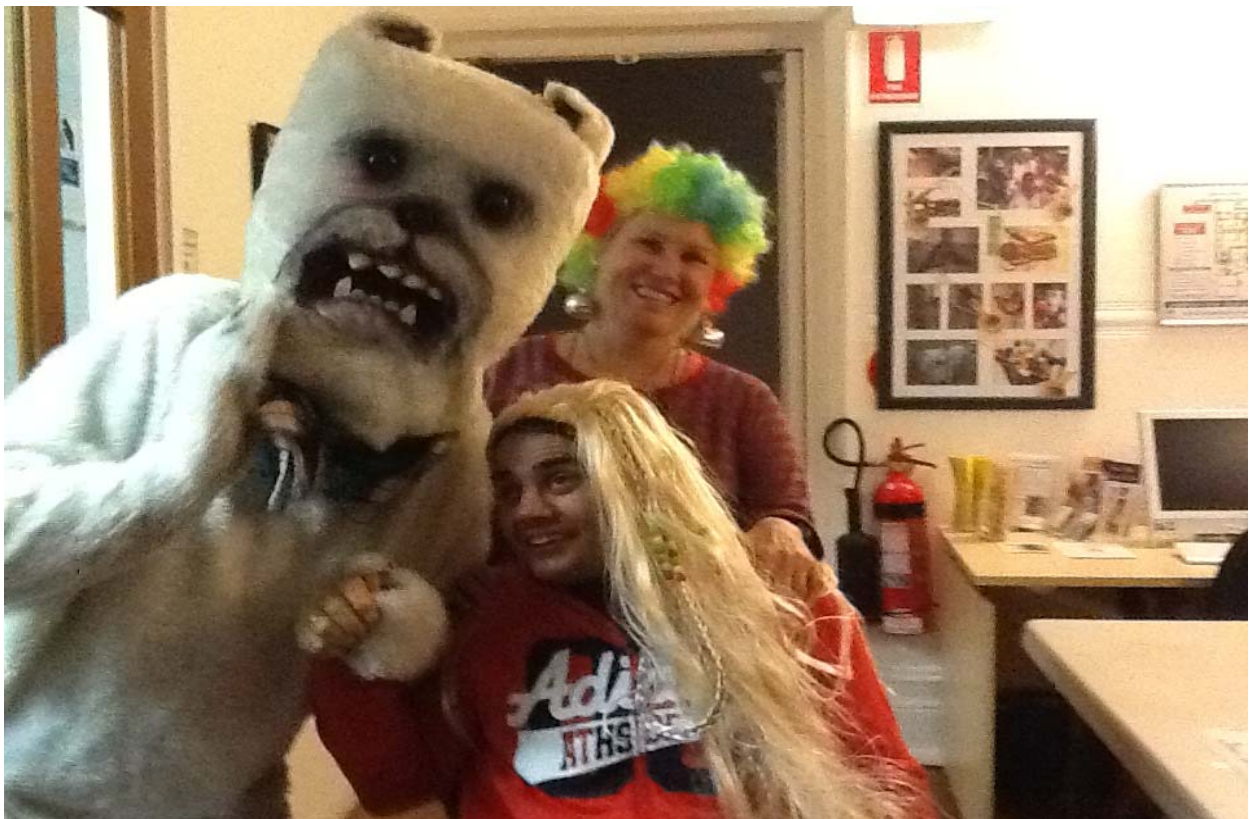
Winter Magic Disco

RAPS had a very busy August. We ventured back to the beautiful Hunter Valley where we did a little shopping, visited the winery and walked through the Hunter Valley Gardens. Later that month the guys were off to Jindabyne, all rugged up in their beanies and gloves. Everyone braved the slopes, threw some snowballs and then warmed up with hot chocolates. A good time was had by all.